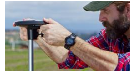
The smart weather and crop sensor, the Arable Mark, is the flagship hardware product of Arable Labs, Inc. It is the only device to combine weather and plant measurements, sent to the cloud for retrieval anytime, anywhere.

GOTHENBURG, Neb., May 23, 2018 / PRNewswire / -- The Nature Conservancy, in collaboration with Nestlé Purina and Cargill, is launching a three-year water project to improve the sustainability of the beef supply chain. This project is expected to reduce the environmental impact of row crop irrigation in Nebraska and provide a scalable irrigation solution for farmers across the U.S.